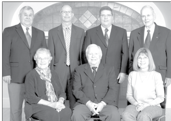
Pendleton Foundation Trust Board of Directors

Pendleton Foundation Trust 222 S.E. Dorion P.O. Box 218 Pendleton, OR. 97801